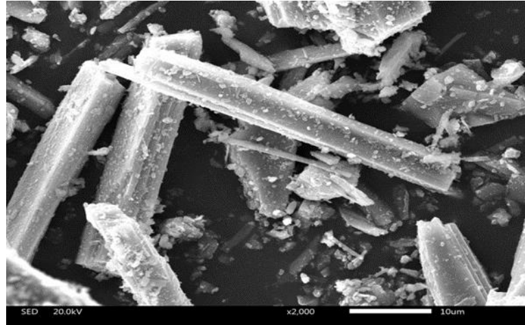
Fig. 1. Microstructure of wollastonite fiber (x2000).