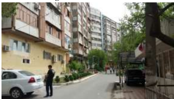
Fig.3. 9-storey residential building in Tashkent