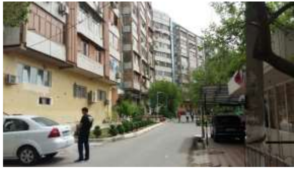
Fig.3. 9-storey residential building in Tashkent